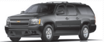
6 Pax SUV - up to 6pp - 6 lg.

YOUR PREFERRED LIMO AND CAR SERVICE IN BOSTON