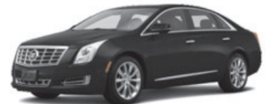
Black Sedan- up to 3pp - 3 lg.