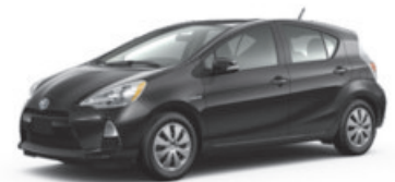
Economy - up to 3pp - 3 lg.